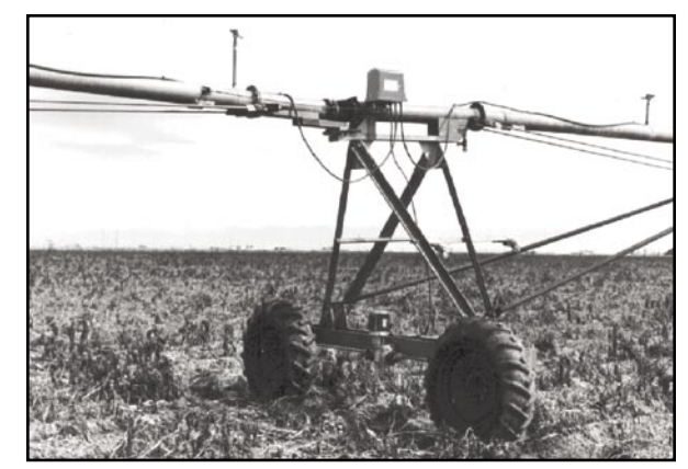
NI Electric Drive & Control Conversion utilizing existing system base deck and structure.