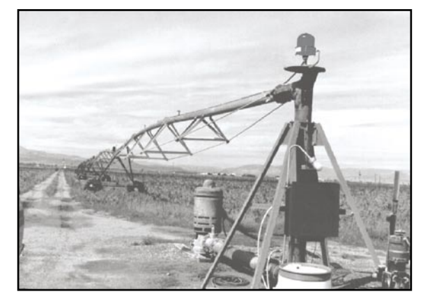
NI Electric Pivot Conversion, including pivot panel with options, collector ring, & accessories.