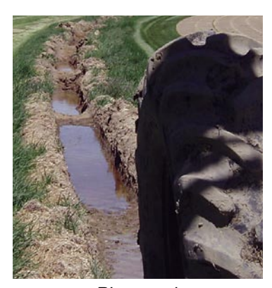
Pivot track without Track Sack.