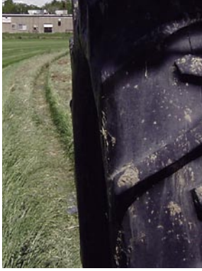
Pivot track with Track Sack.