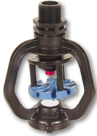
i-Wob, Complete, w/ M NPT Base

Includes Nozzle & Base; excludes weight.