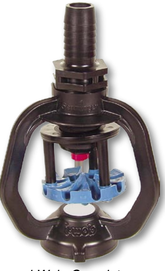
i-Wob, Complete, w/ Barb Base