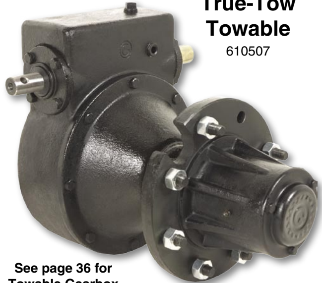
See page 36 for Towable Gearbox Accessories.