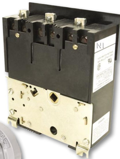
Main Disconnect Switch 93666