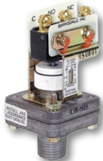
93643 or 936136