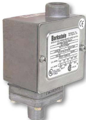
93609 or 936200