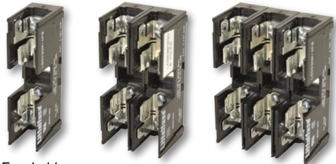
Fuseholder, 1-Pole 56001