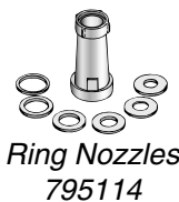
Ring Nozzles 795114