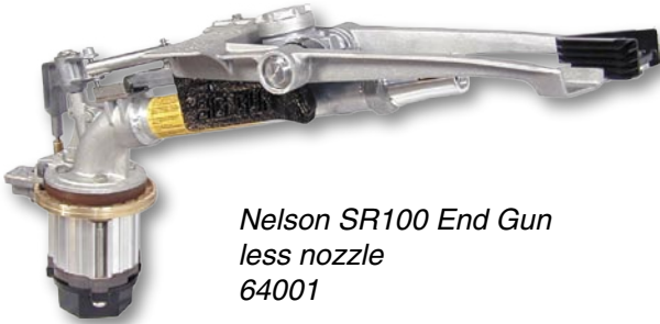
Nelson SR100 End Gun less nozzle 64001