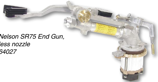
Nelson SR75 End Gun, less nozzle 64027