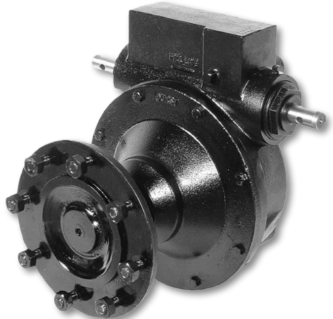
Durst Valley Style Gearbox, 52:1 610104

With all the features listed above and on the previous page, this Valley Style Gearbox has a 50:1 gear ratio and standard short output shaft.